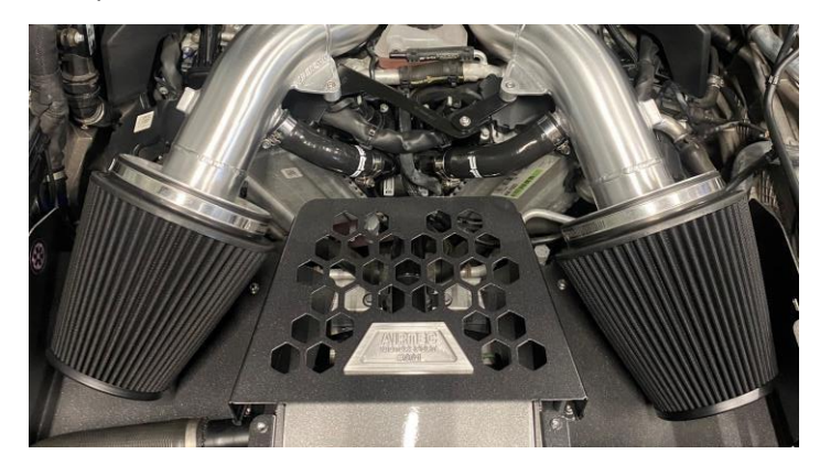
16. Finally, fit the air box lids using the 10x M5mm Button Head bolts supplied and check everything is tight.