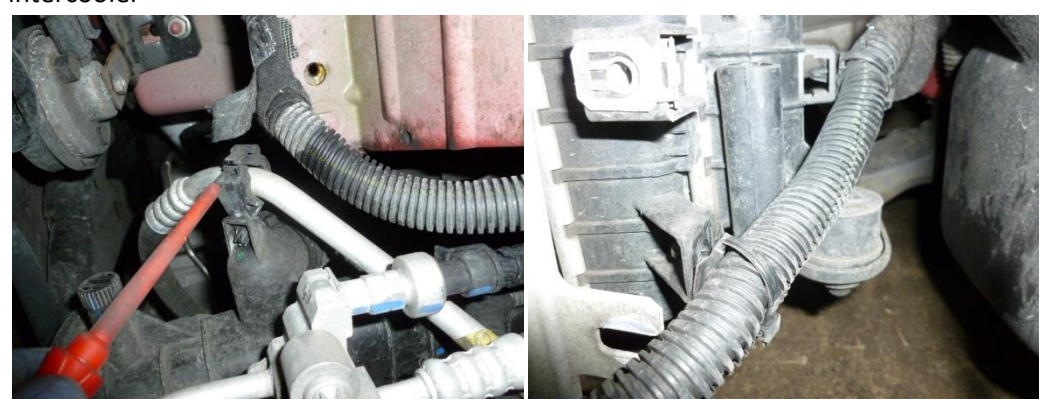
18. Remove 2 x T10 bolts securing top of standard intercooler to radiator, then remove top rubber hose