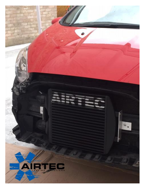
*PLEASE NOTE: Some minor trimming may be required to the lower grill*

7. At this point you will need to fit the alloy brackets onto the intercooler with the bolts provided, place the intercooler onto the front panel @ the same time installing the 2x 90 degree silicon bends.