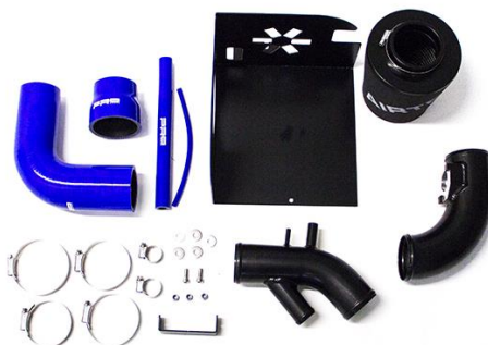
Mazda MK2 'U' Shaped Bracket