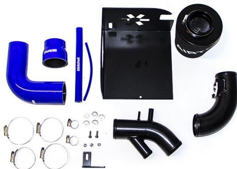
Mazda MK1 'L' Shaped Bracket